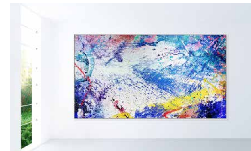
Installation of Painting from the "Napa Valley" Series, #60, 2018

Along with expanding his galleries, there are exhibitions scheduled in several places around the world, including California, Seoul, Dubai, London and Miami.