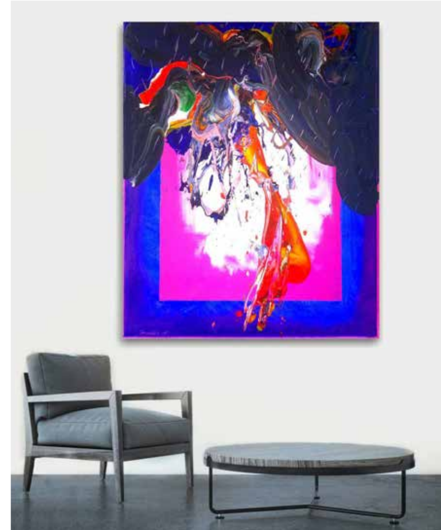
Installation of Painting from the "Storm" Series, 2018 #5

He's convinced that everyone is an artist. As long as they can remain authentic to their vision, beauty can be created. Encouraging words of wisdom from a person who didn't receive a lot of direction at the beginning of his art career.