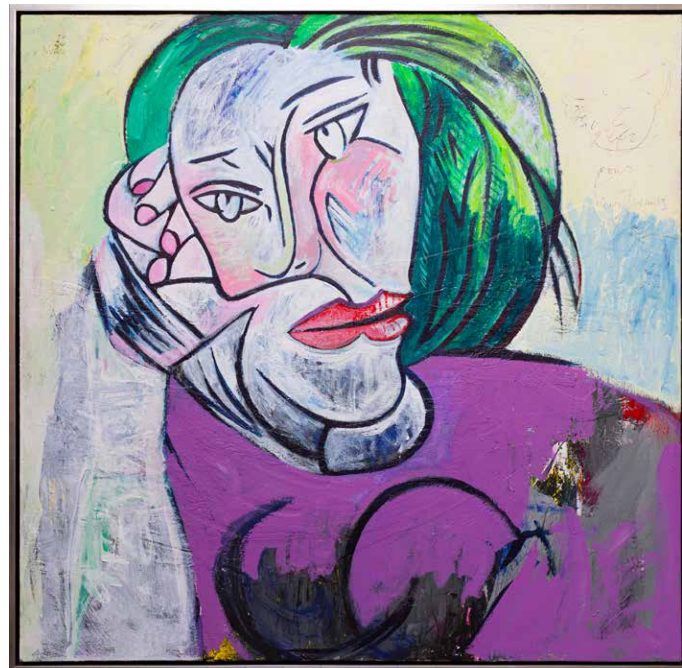
Abstract Portrait, 2018

Perhaps. This magical dreamland that he shares with us now has provided success, both creatively and financially. His relationship with designers, architects, developers and loyal collectors is enviable. And yet he remains incredibly humble. Recognition as a star artist hasn't blinded him, and keeps his works exciting and compelling!