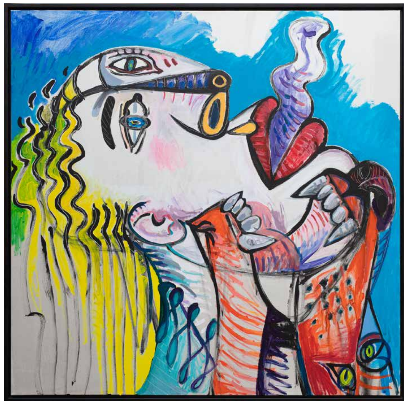
Painting of "A Woman and a Cat Screaming"