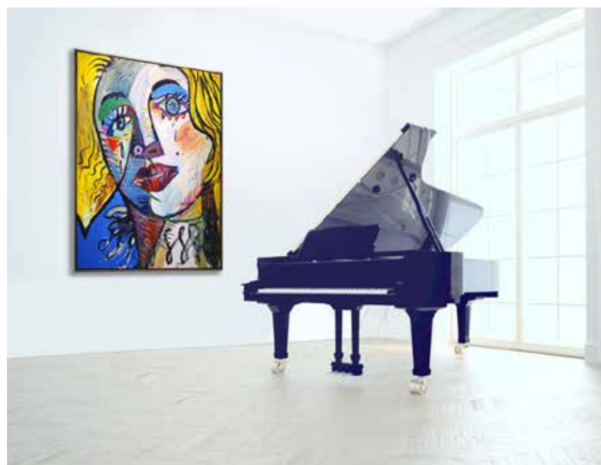
Installation of Painting "Venus Cries"

I was curious about how he uses art to communicate to the world, and what his motivation was.