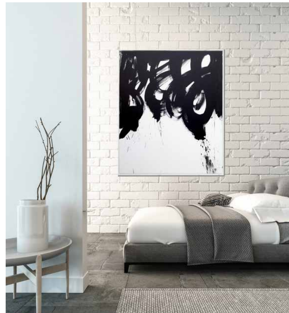
Above & Opposite: Installation of Painting from the "Black & White" Series, #98

it's a million times better. It's always fascinating when you can let go and let it take you for a journey. If you want to control the canvas, I don't think you're going for a ride."