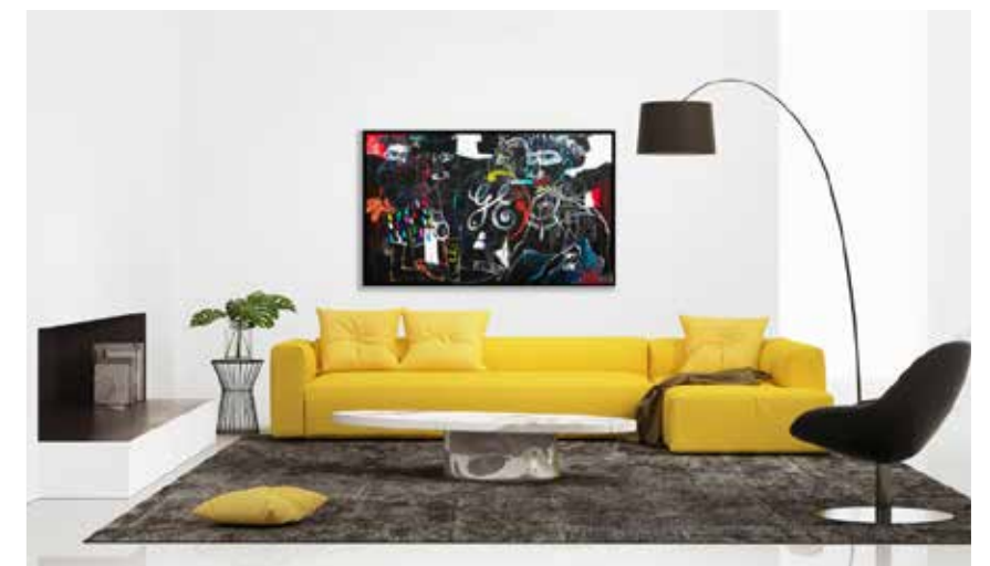
Above: Installation of Painting by Triantos "Homage to Basquiat" - Also on the Following page