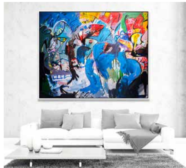
Installation of Painting "Blue Gorilla" 2020

"The amount of work is a lot more than people can imagine and age doesn't guarantee success. I hear some young artists say "Oh, when I'm your age I will have all..." but age doesn't guarantee anything. You have to work towards goals that are achievable. You've got to have dreams and try hard to make them happen. Only you can make them happen because if you leave it in other people's hands I believe you will be let down. So make that dream happen. Try as hard as you can."