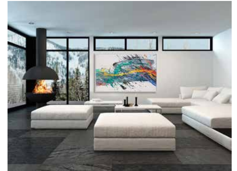
Above: Installation of Painting from the "Splash of Colour 2" Series, #177

Like many of us, he eventually reached a fork in the road: go left or right? To choose from the security of remaining a carpenter to the unknown of facing the blank canvas as an artist. It takes courage to choose the right path. And through the brushstrokes of faith and fate, I'm glad that he made the right choice.