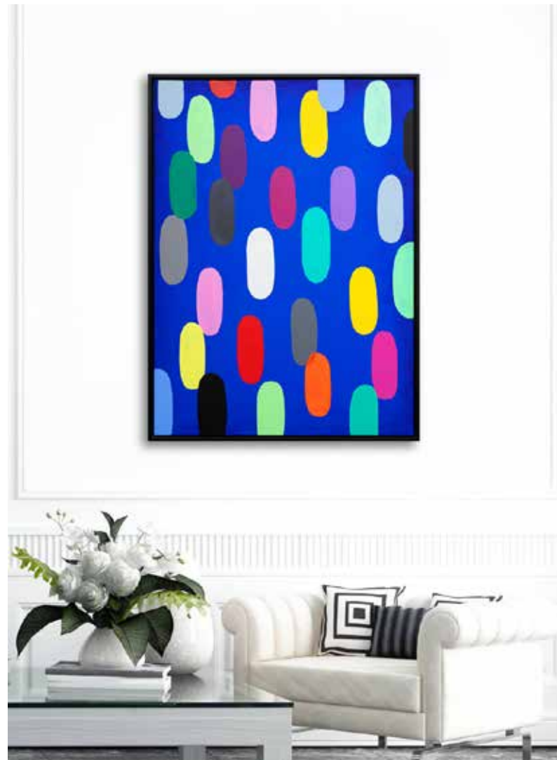
Installation of Painting from the "Jelly Bean" Series, #69

"Life is pure adventure, and the sooner we realize that, the quicker we will be able to treat life as art."