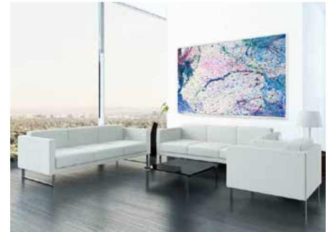
Installation of Painting from the "Napa Valley" Series, #77, 2019