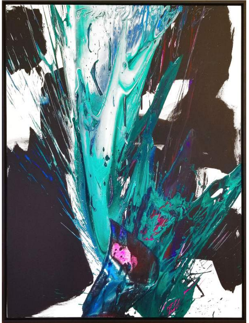
SP 2 #116, 2018, acrylic on canvas