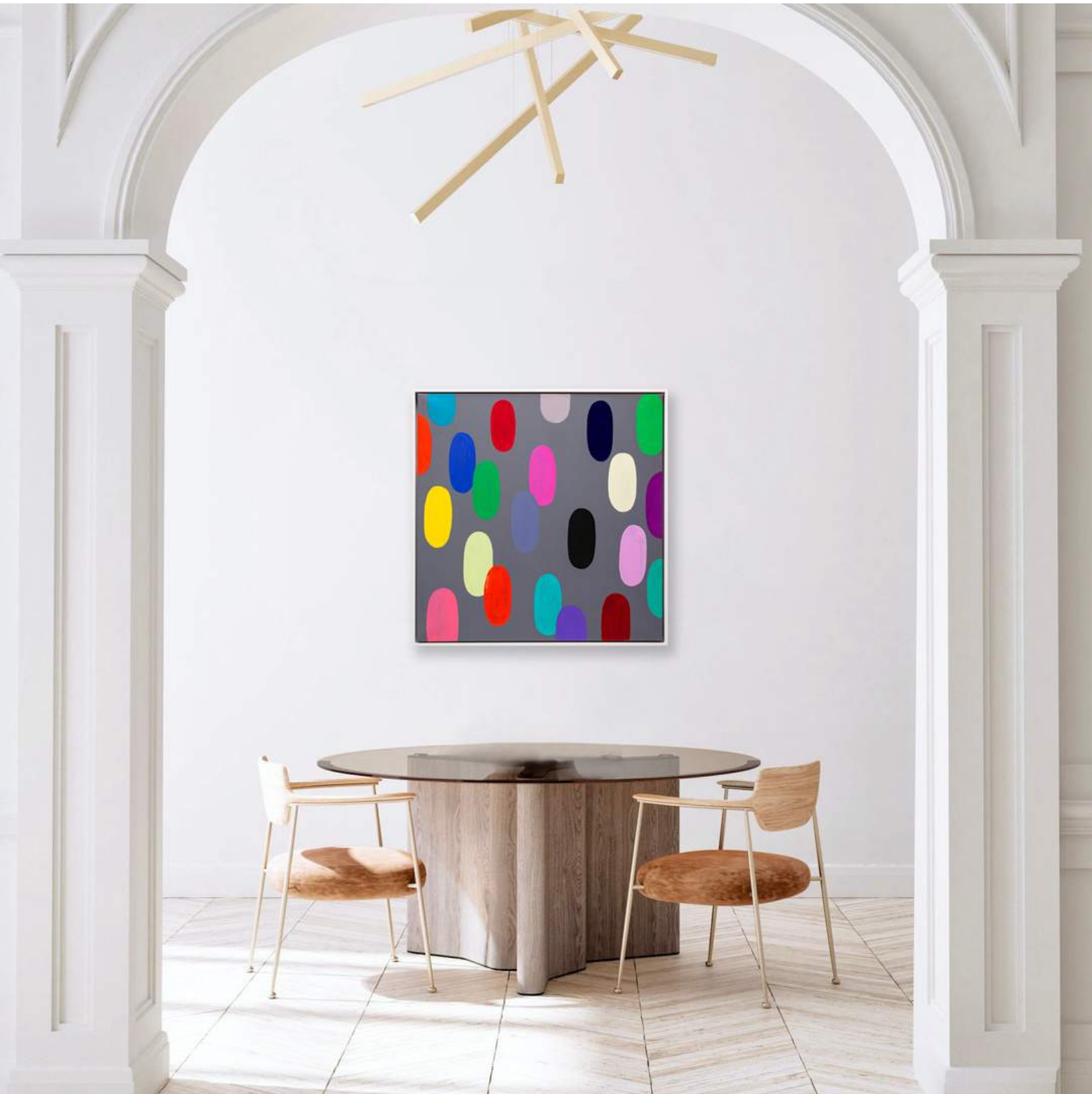
PETER TRIANTOS Jelly Bean #82, 2022 acrylic on canvas 36 x 36 in | 91.4 x 91.4 cm