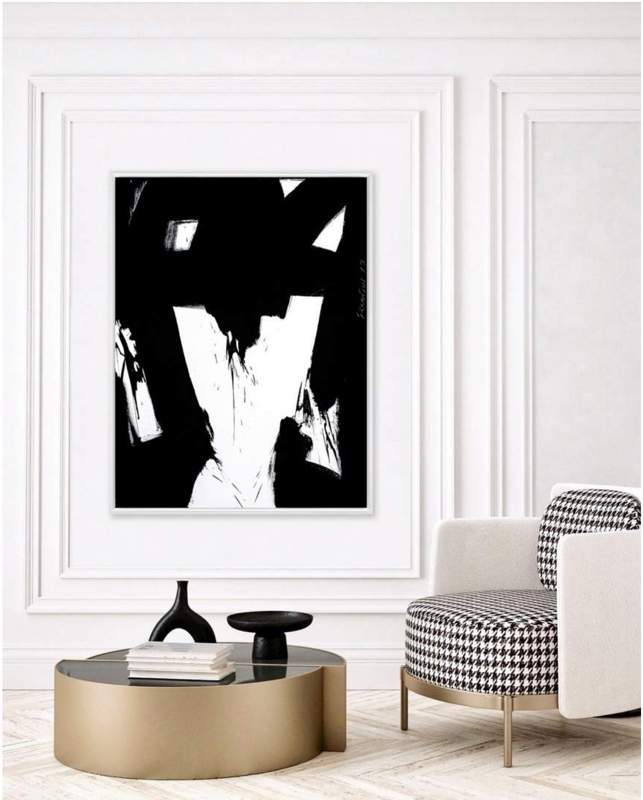
PETER TRIANTOS Black and White #120, 2022 acrylic on canvas 48 x 36 in | 122 x 91.4 cm