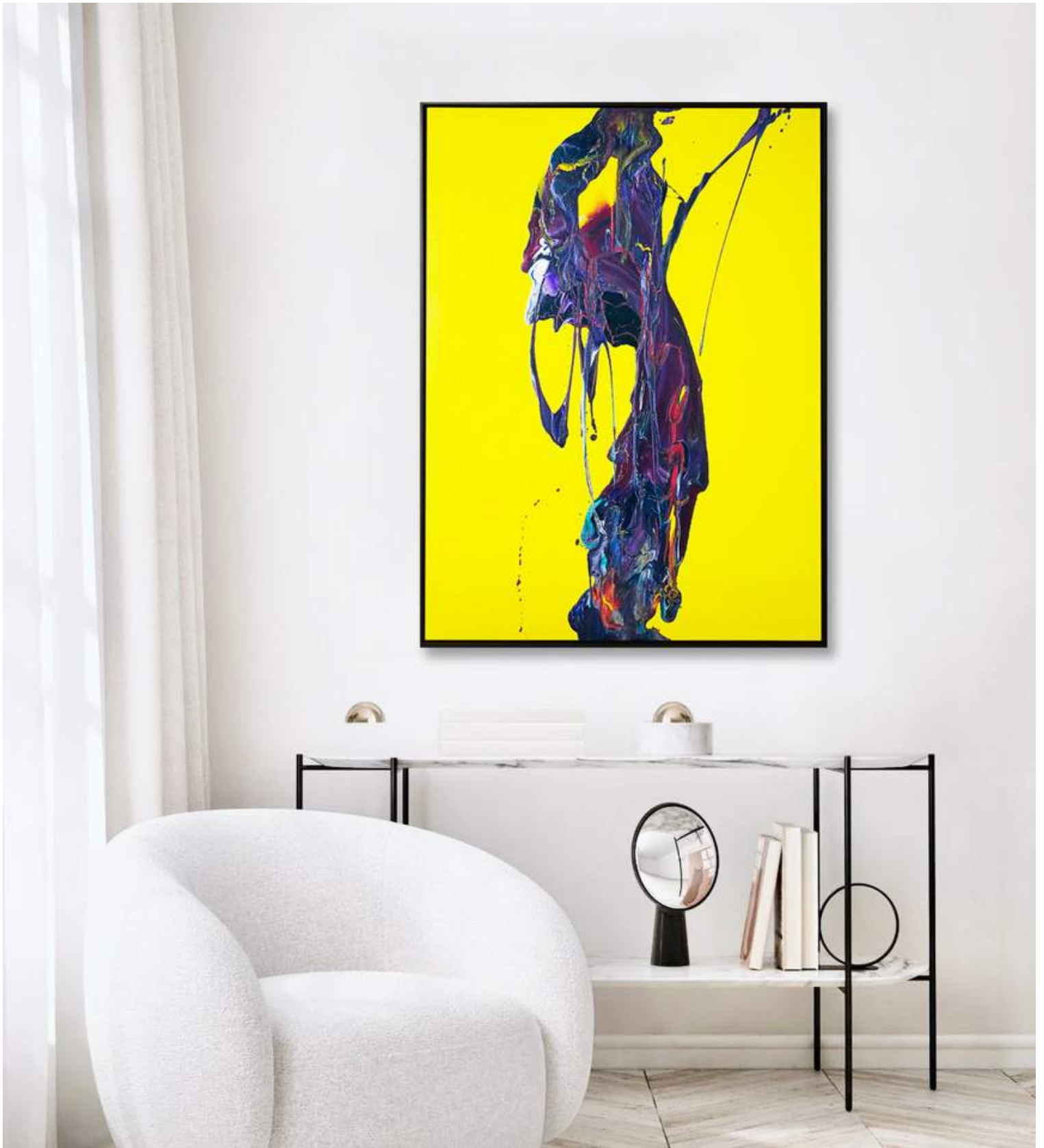
PETER TRIANTOS SP 2 #123, 2018 acrylic on canvas 48 x 36 in | 122 x 91.4 cm