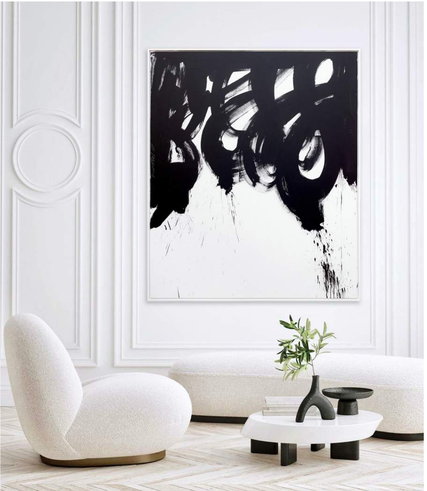
PETER TRIANTOS Black and White #98, 2019 acrylic on canvas 72 x 60 in | 183 x 152.4 cm