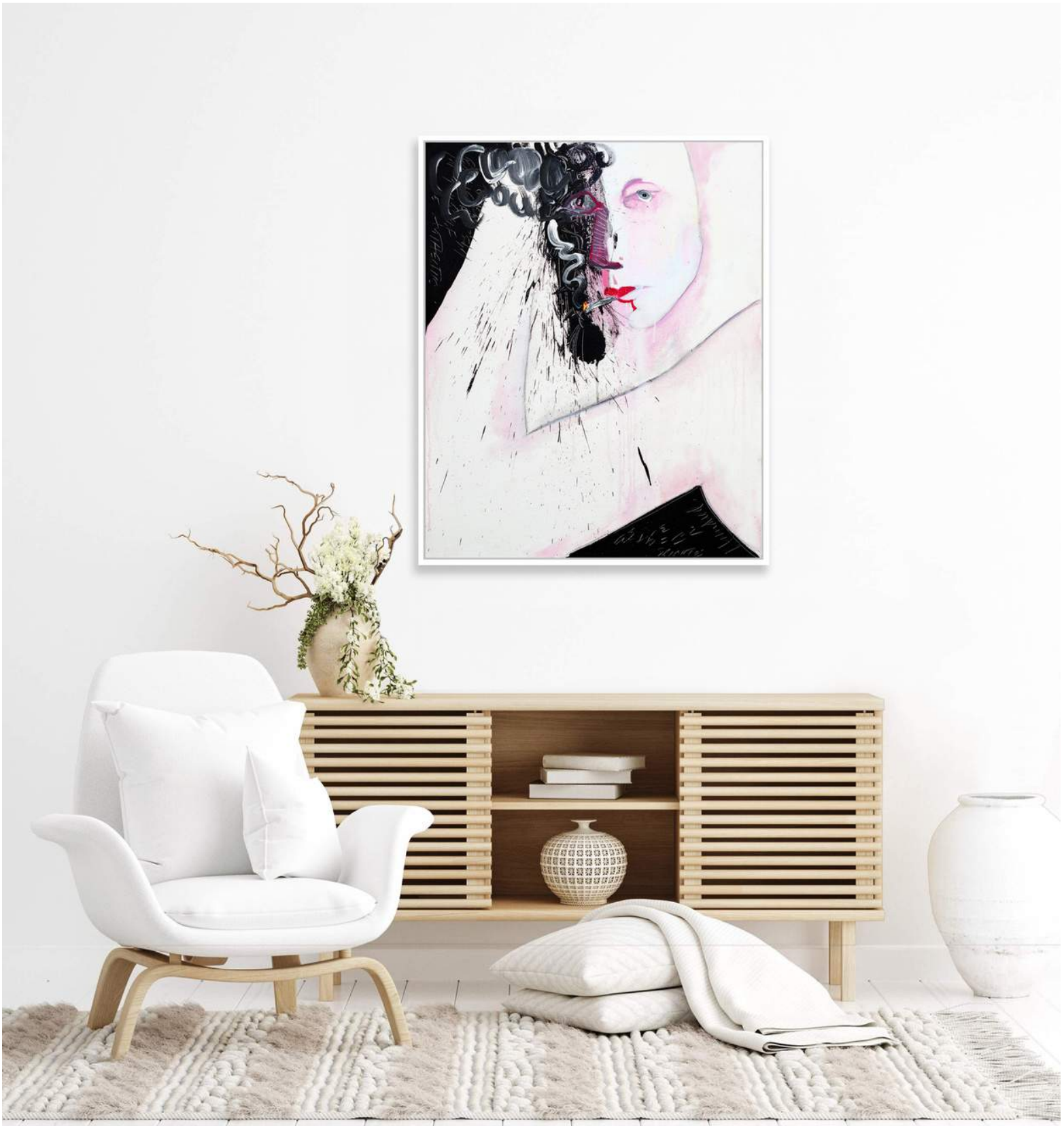
PETER TRIANTOS Untitled #13, 2021 acrylic on canvas 30 x 24 in | 76 x 61 cm