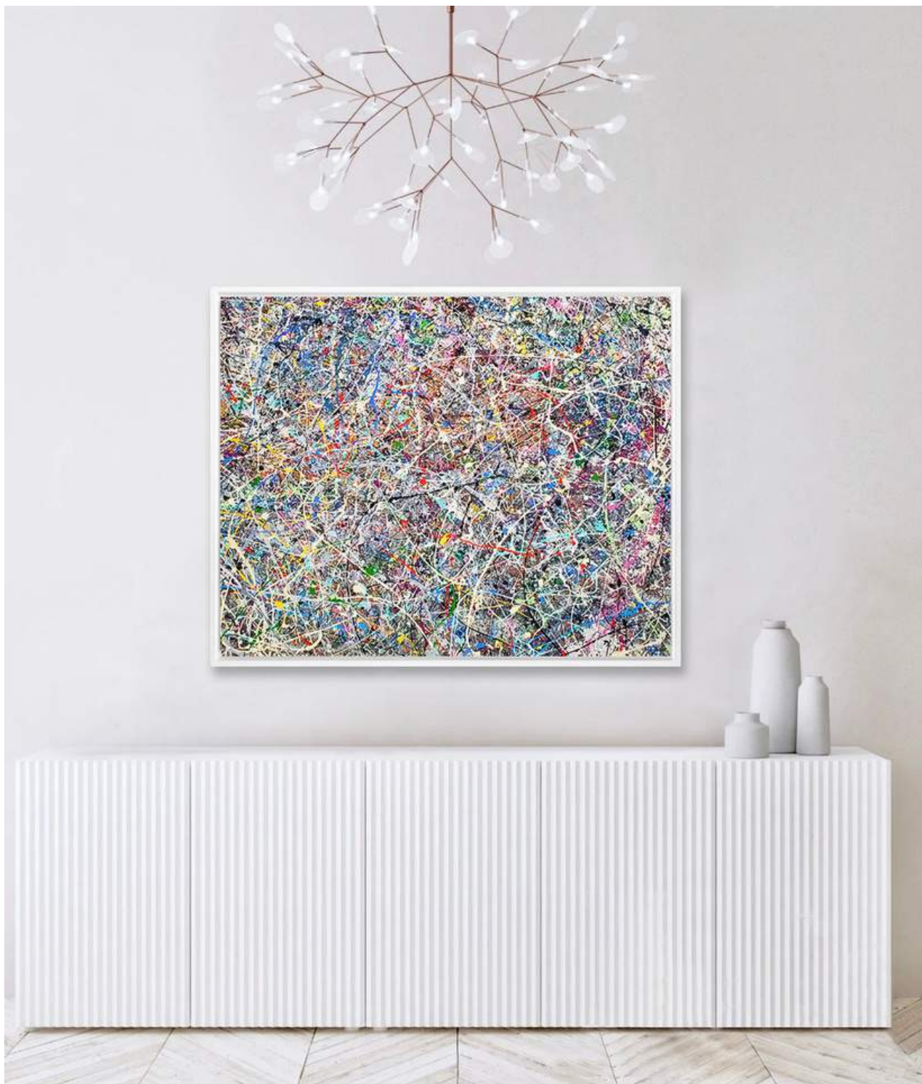
PETER TRIANTOS Winter Paradise #27, 2019 acrylic on canvas 48 x 38 1/2 in | 122 x 98 cm