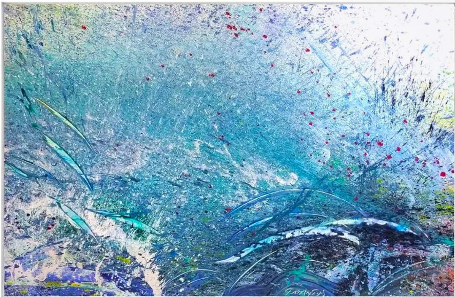
PETER TRIANTOS Napa Valley #89, 2019 acrylic on canvas 70 x 106 in | 178 x 269 cm