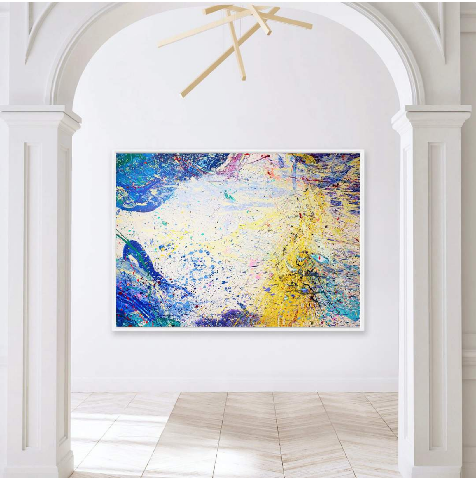
PETER TRIANTOS Napa Valley #78, 2019 acrylic on canvas 60 x 84 in | 152.4 x 213.4 cm