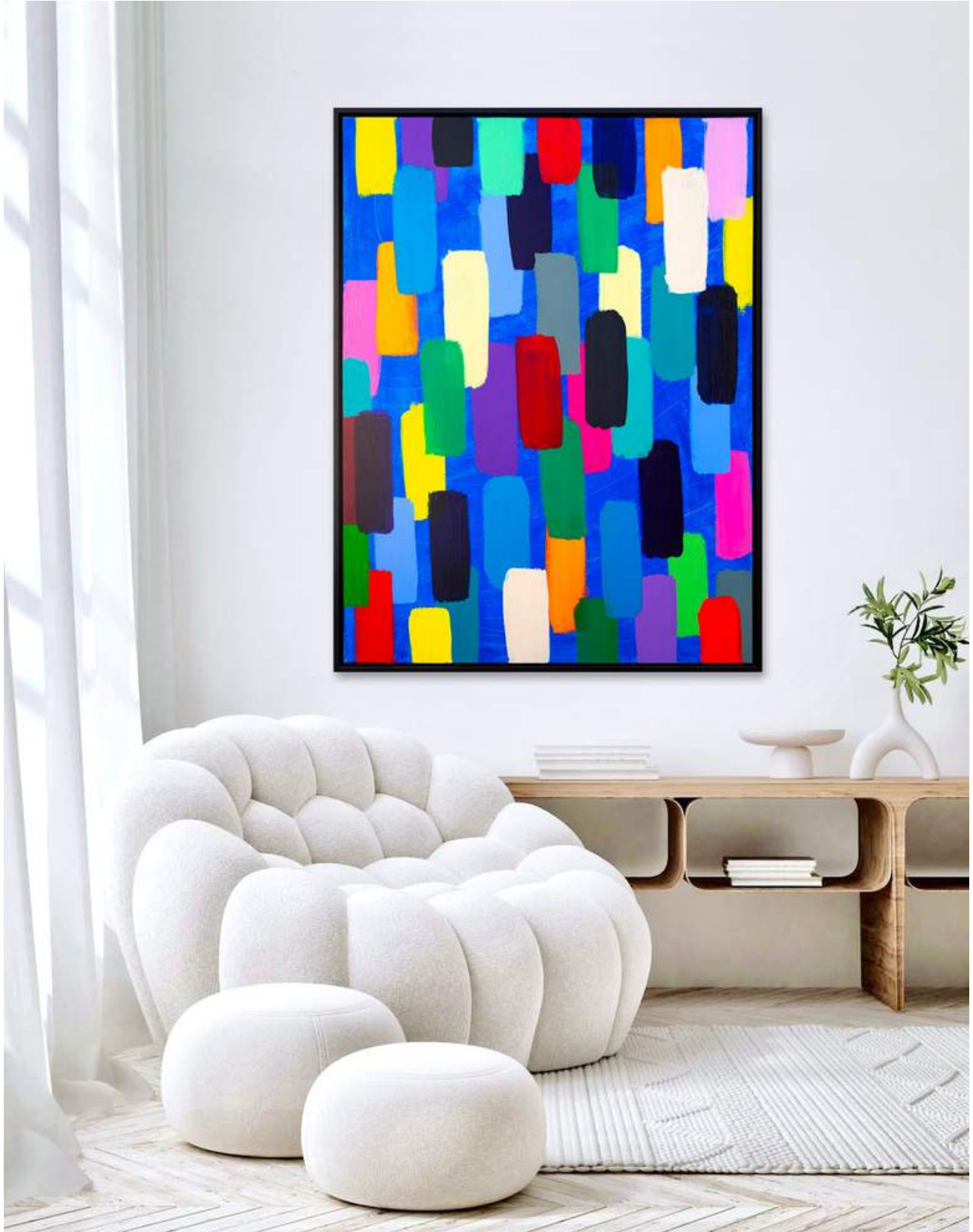
PETER TRIANTOS Jelly Bean #25, 2018 acrylic on canvas 48 x 36 in | 122 x 91.4 cm