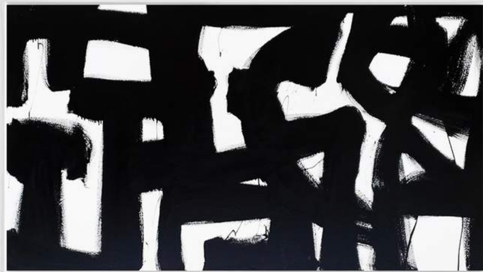
PETER TRIANTOS Black and White #86, 2019 acrylic on canvas 48 x 84 in | 122 x 213 cm