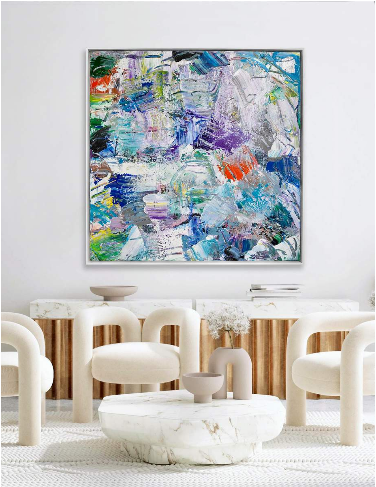
PETER TRIANTOS Impasto #22, 2019 acrylic on canvas 48 x 48 in | 122 x 122 cm