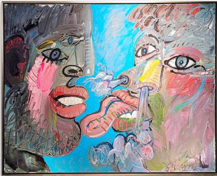
PETER TRIANTOS Untitled #56, 2019 acrylic on canvas 48 x 60 in | 122 x 152.4 cm