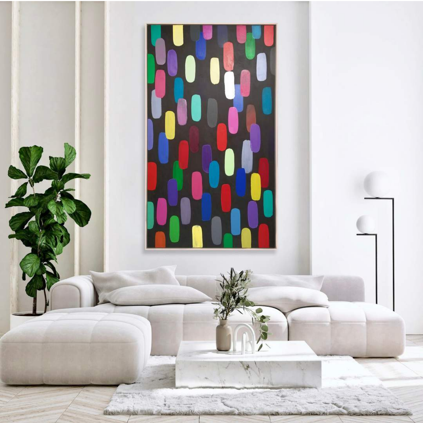
PETER TRIANTOS Jelly Bean #34, 2018 acrylic on canvas 84 x 48 in | 213.4 x 122 cm