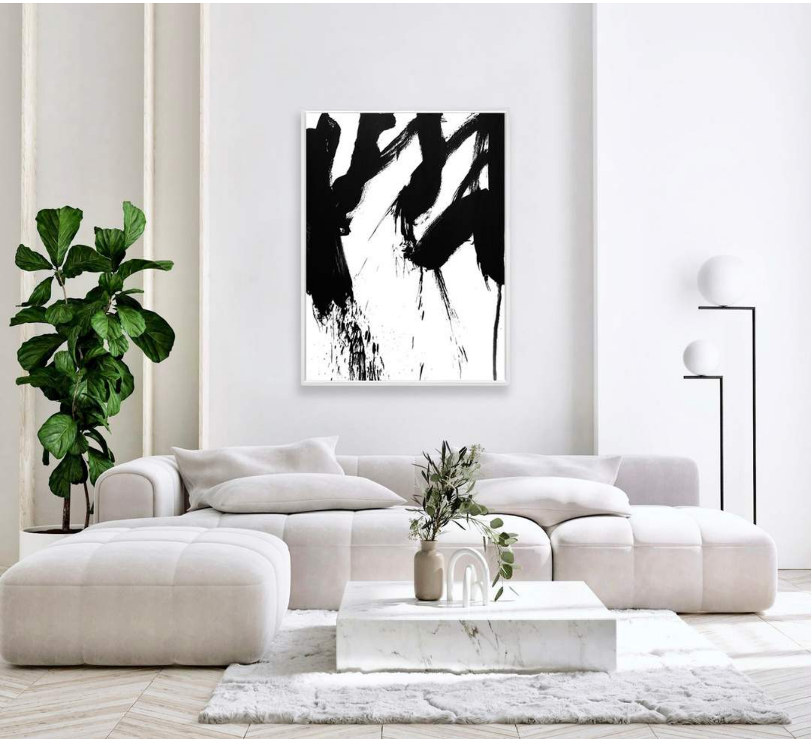
PETER TRIANTOS Black and White #96, 2019 acrylic on canvas 53 x 40 in | 134.6 x 101.6 cm