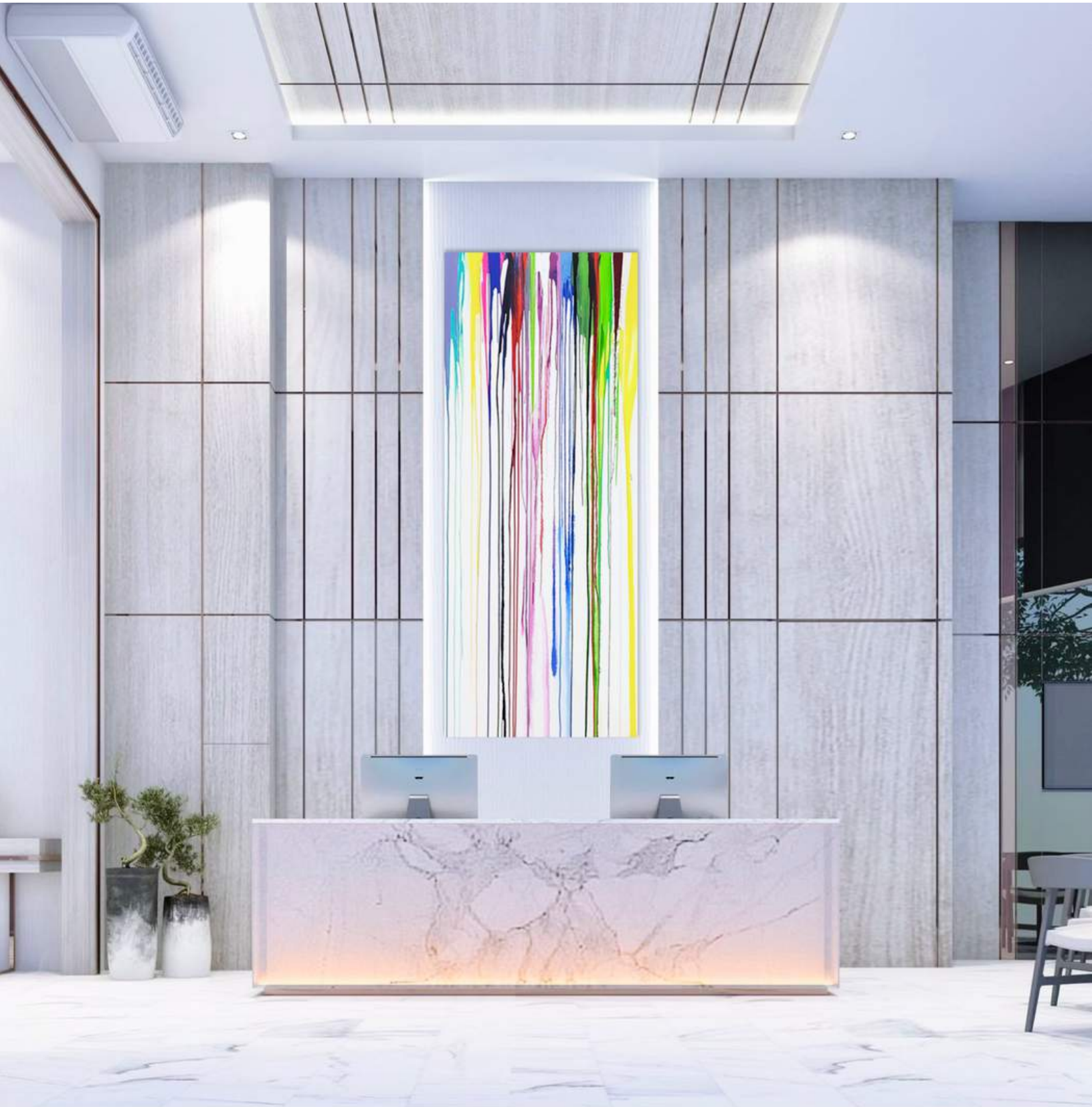
PETER TRIANTOS Splash of Colour #39, 2019 acrylic on canvas 120 x 50 in | 305 x 127 cm