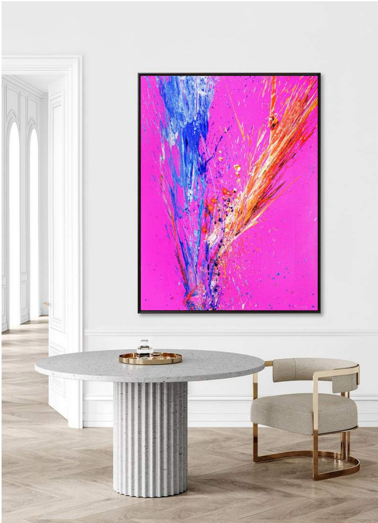
PETER TRIANTOS SP 2 #117, 2022 acrylic on canvas 60 x 48 in | 152.4 x 122 cm