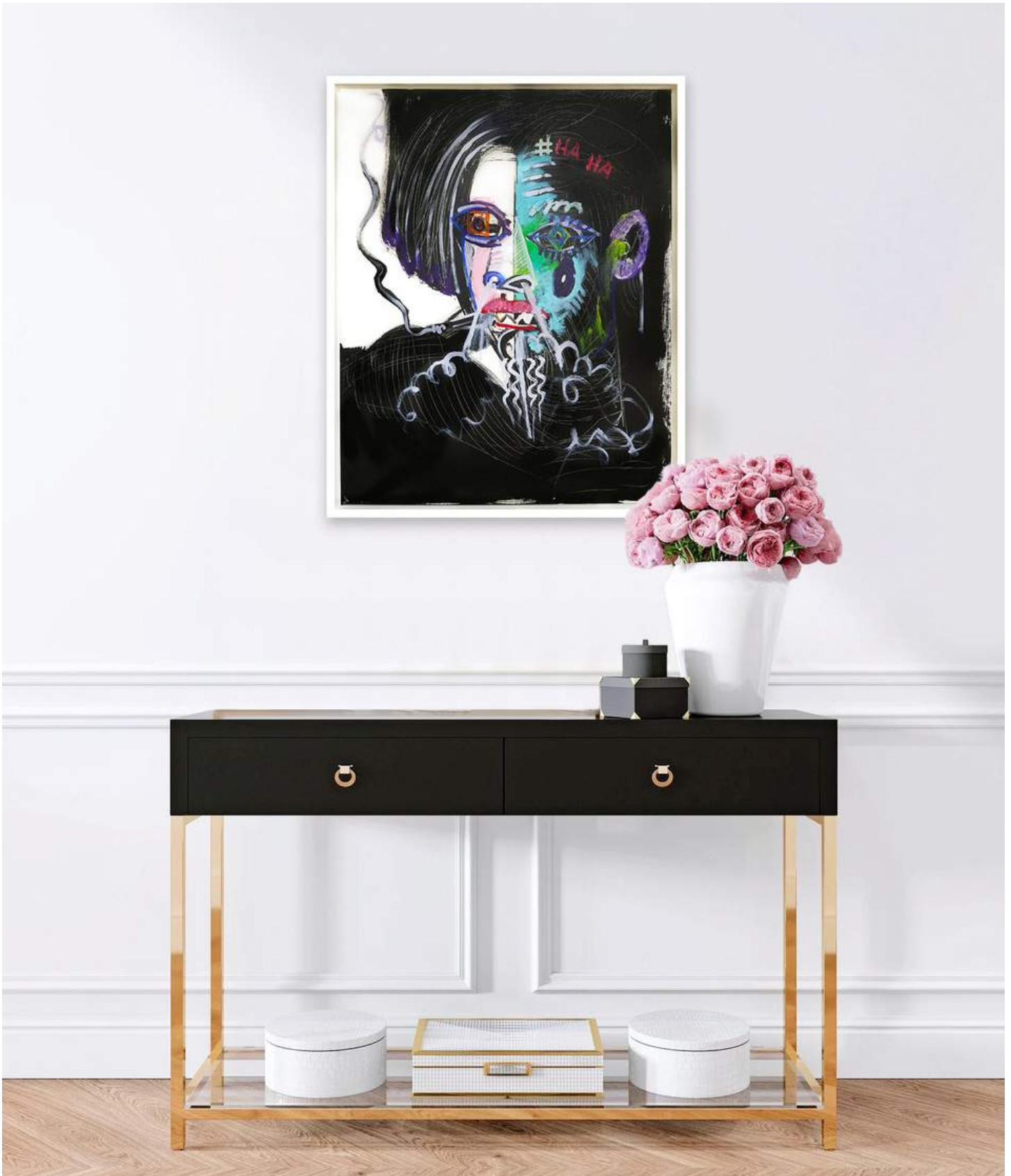
PETER TRIANTOS Untitled #83, 2018 acrylic on canvas 30 x 24 in | 76 x 61 cm