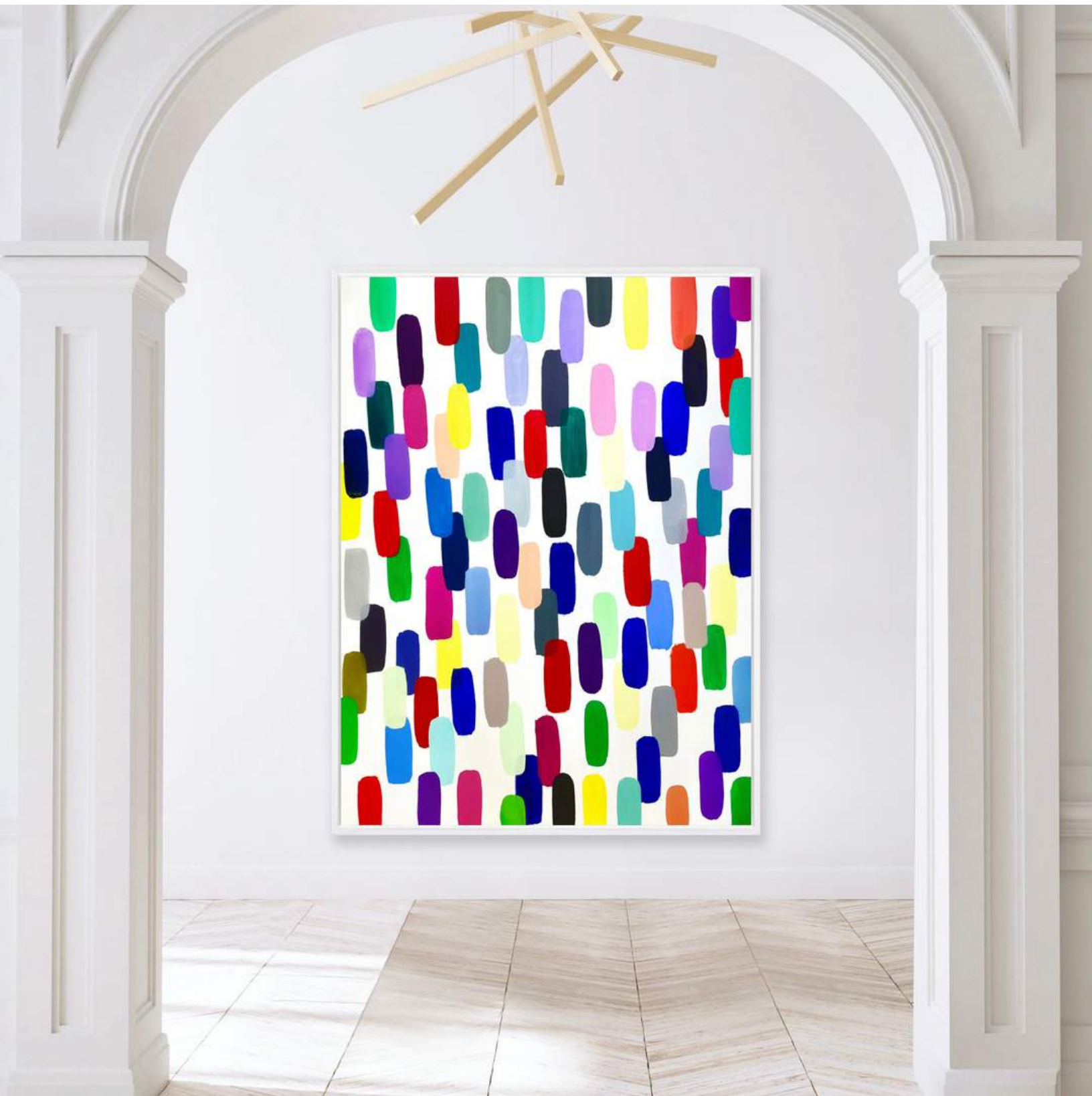
PETER TRIANTOS Jelly Bean #109, 2018 acrylic on canvas 96 x 72 in | 244 x 183 cm