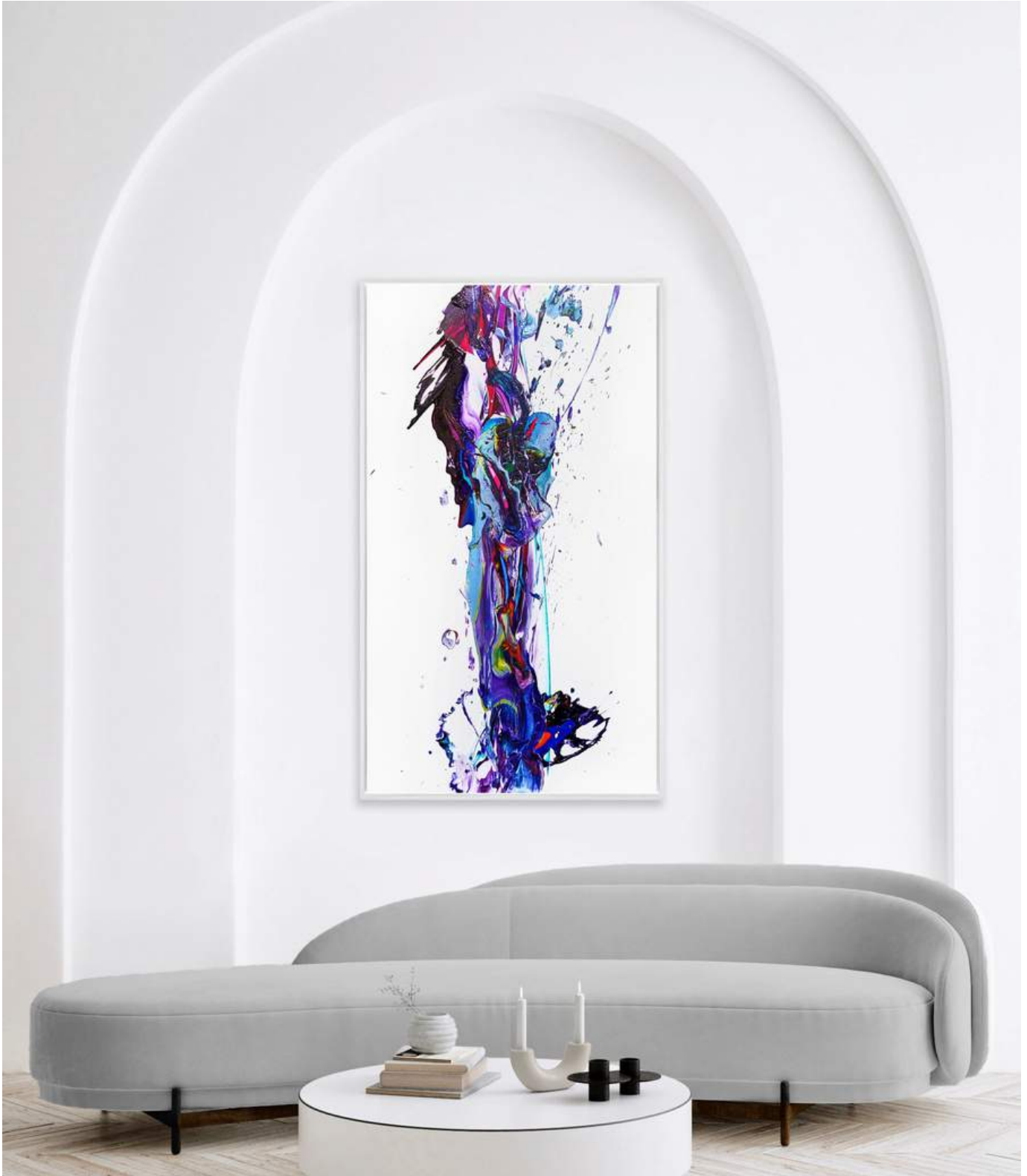
PETER TRIANTOS SP 2 #88, 2018 acrylic on canvas 60 x 36 in | 152.4 x 91.4 cm