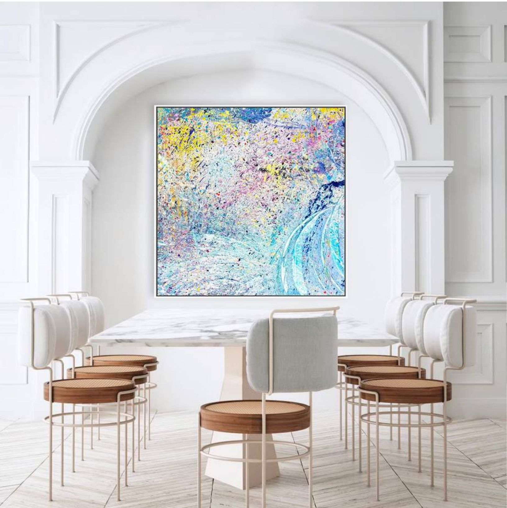
PETER TRIANTOS Napa Valley #116, 2020 acrylic on canvas 70 x 70 in | 178 x 178 cm