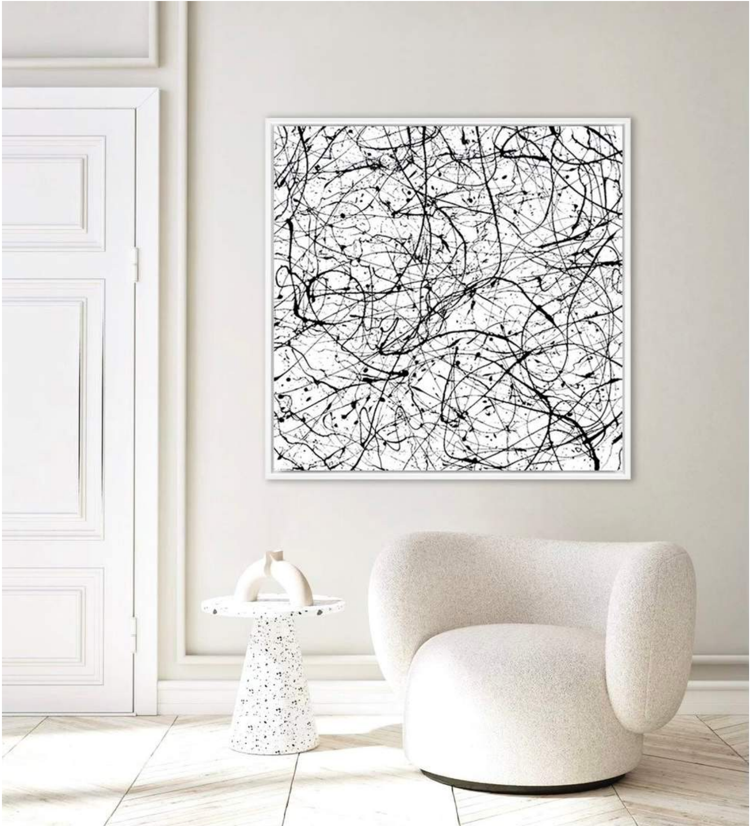
PETER TRIANTOS Winter Paradise #26, 2019 acrylic on canvas 48 x 48 in | 122 x 122 cm