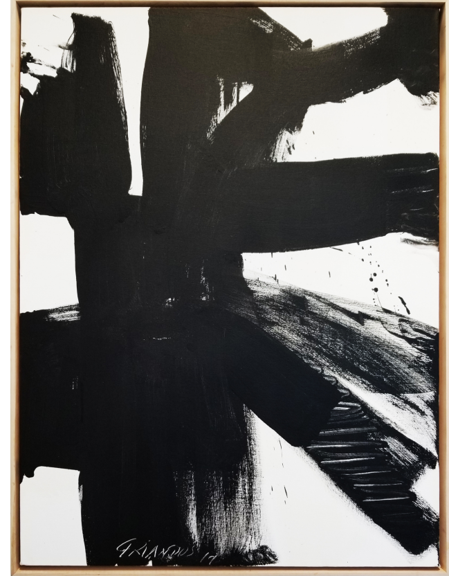
Black and White #3, 2017, acrylic on canvas, 40" x 30'

His other love: four kittens that were found in a garage on the verge of death. He takes me to see them and four pairs of tiny eyes are staring at me. As soon as he opens the little gate, they start jumping around and climbing the sculptures. "Is it okay that they climb these art pieces?" "Absolutely. I love them, they can do as they please. You can tell how amazing people are by how happy their animals are."