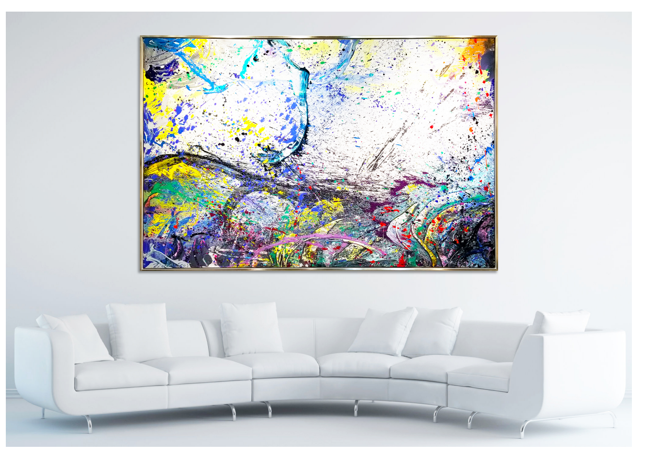
Napa Valley #25, 2018, acrylic on canvas, 72 x 108