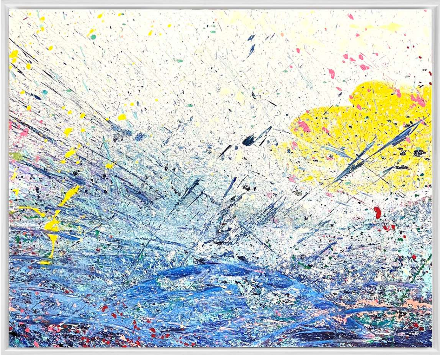
PETER TRIANTOS Napa Valley #138, 2023 acrylic on canvas 48" x 60" | 122 x 152.4 cm