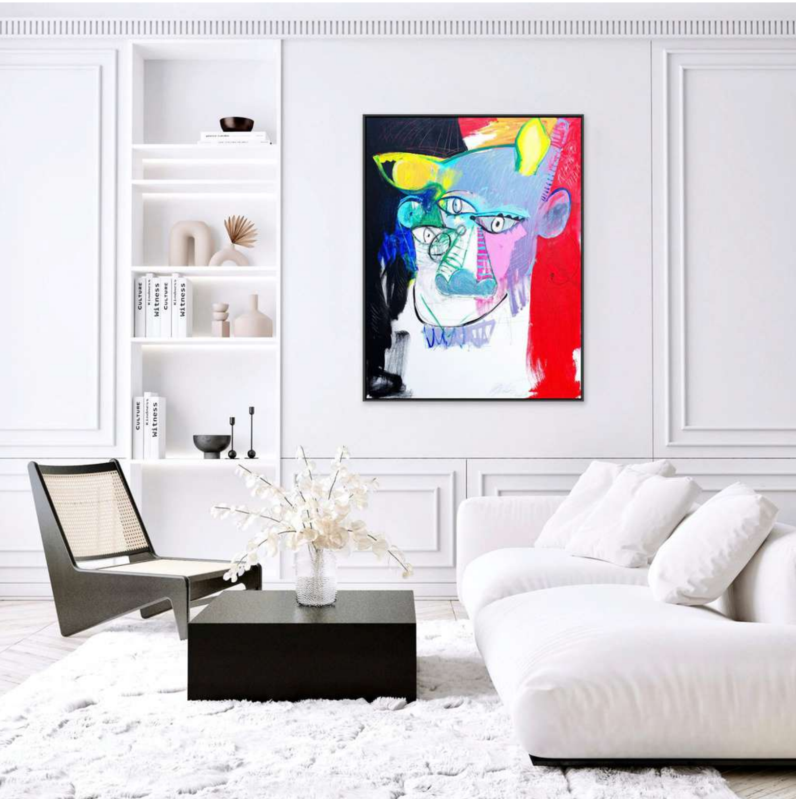
PETER TRIANTOS Rhinoman, 2021 acrylic on canvas 48" x 36" | 122 x 91.4 cm