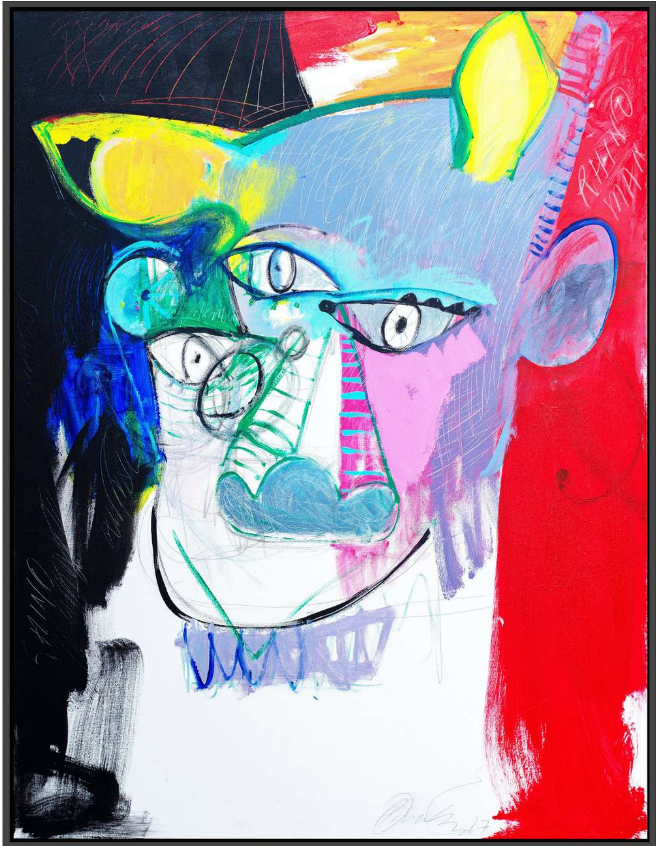
PETER TRIANTOS Rhinoman, 2021 acrylic on canvas 48" x 36" | 122 x 91.4 cm