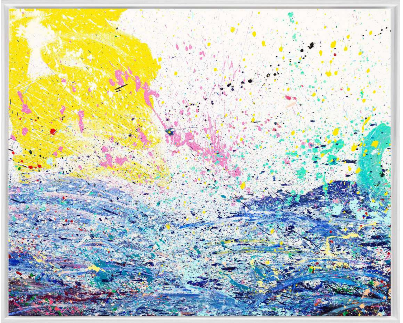
PETER TRIANTOS Napa Valley #137, 2023 acrylic on canvas 48" x 60" | 122 x 152.4 cm