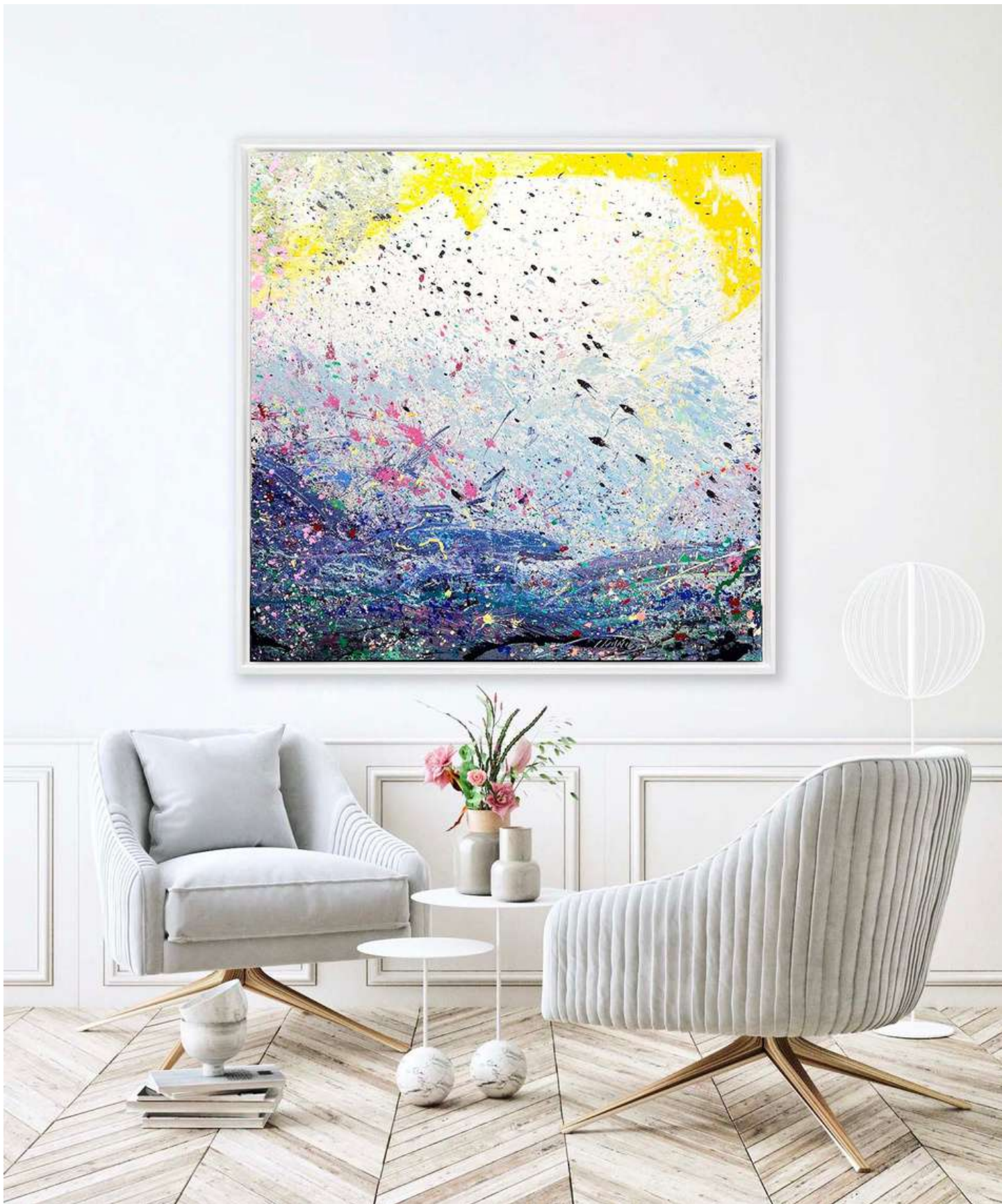
PETER TRIANTOS Napa Valley #135, 2023 acrylic on canvas 60" x 60" | 152.4 x 152.4 cm