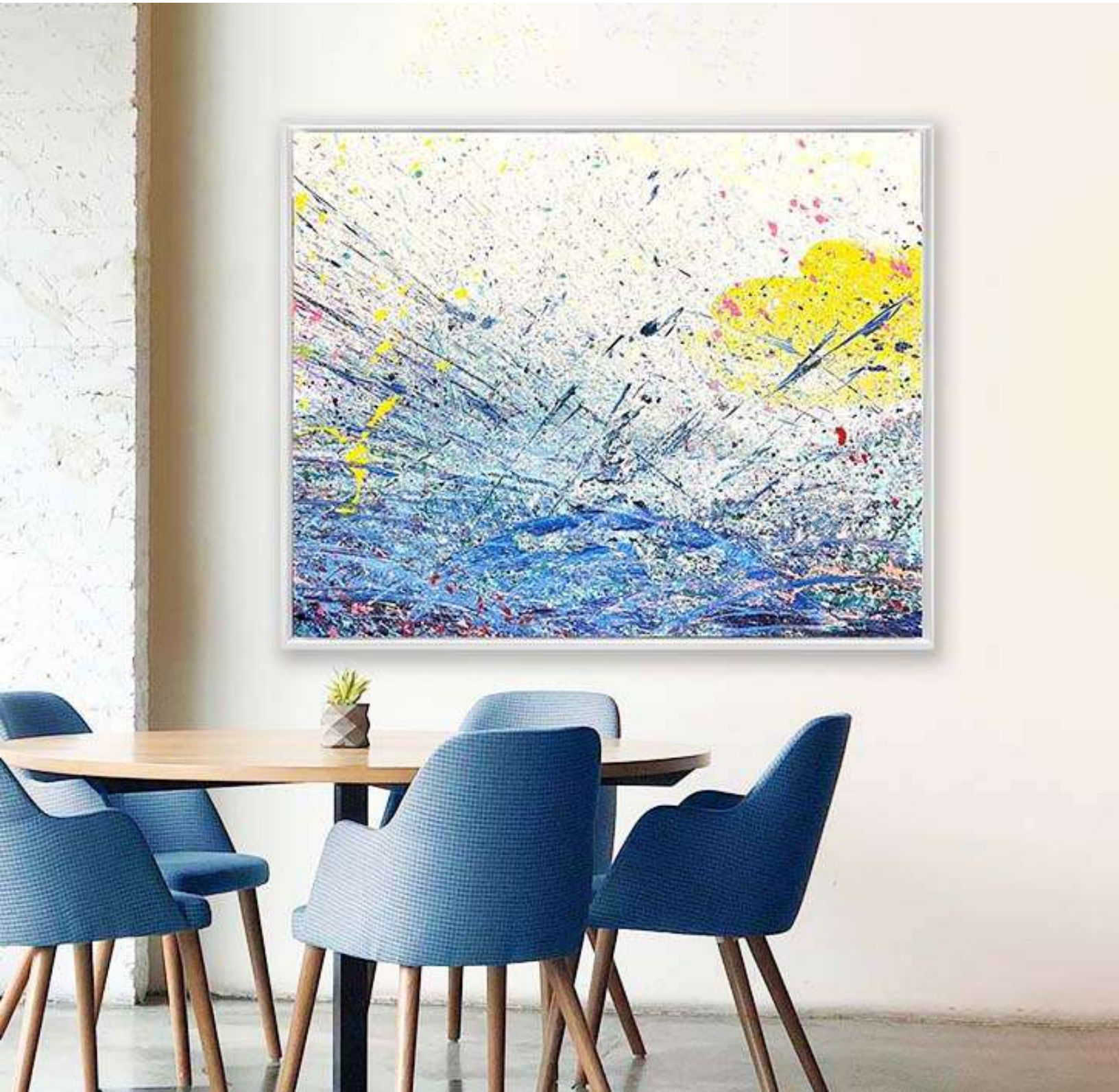
PETER TRIANTOS Napa Valley #138, 2023 acrylic on canvas 48" x 60" | 122 x 152.4 cm