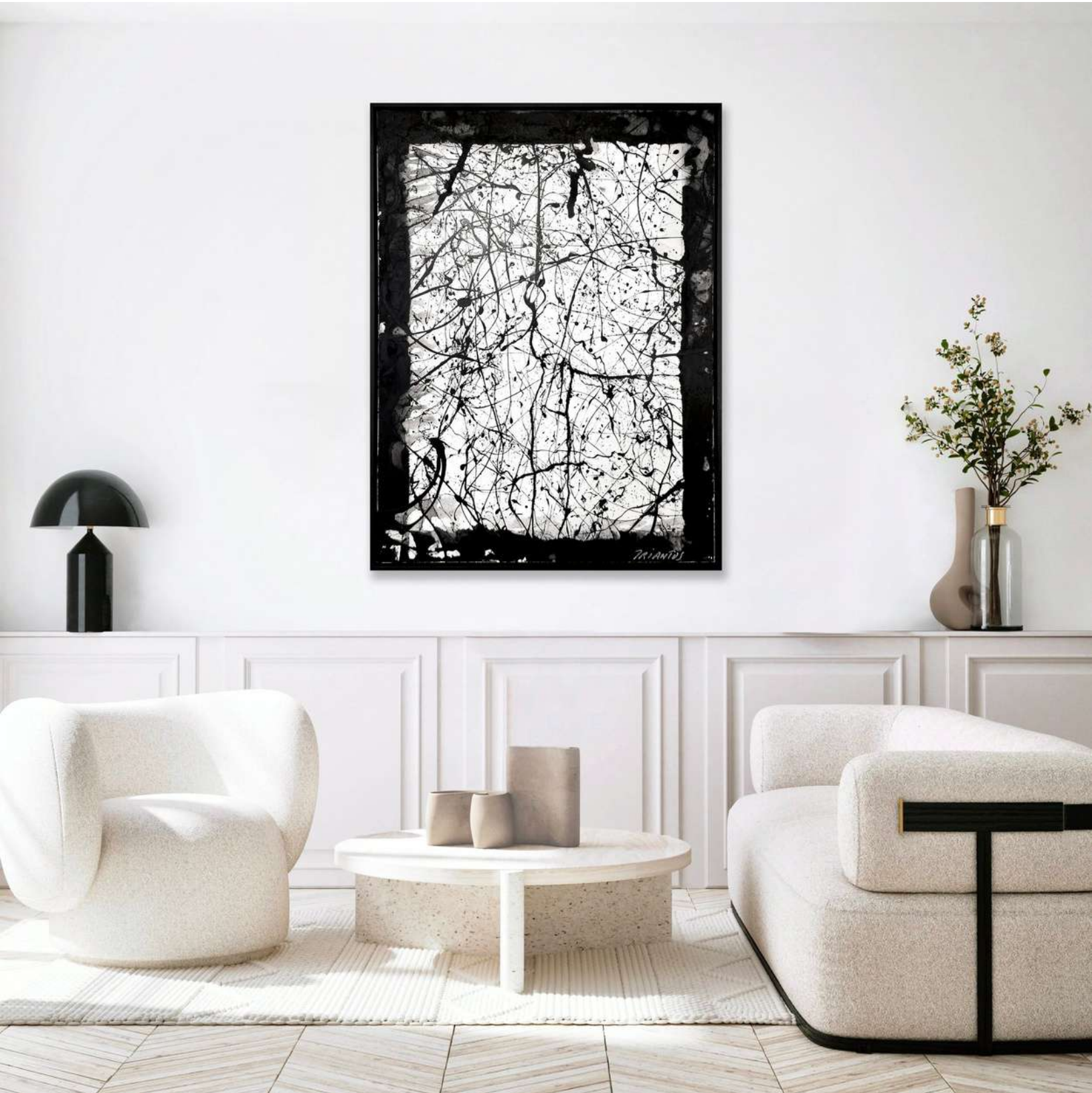
PETER TRIANTOS Winter Paradise #51, 2023 acrylic on canvas 48" x 36" | 122 x 91.5 cm