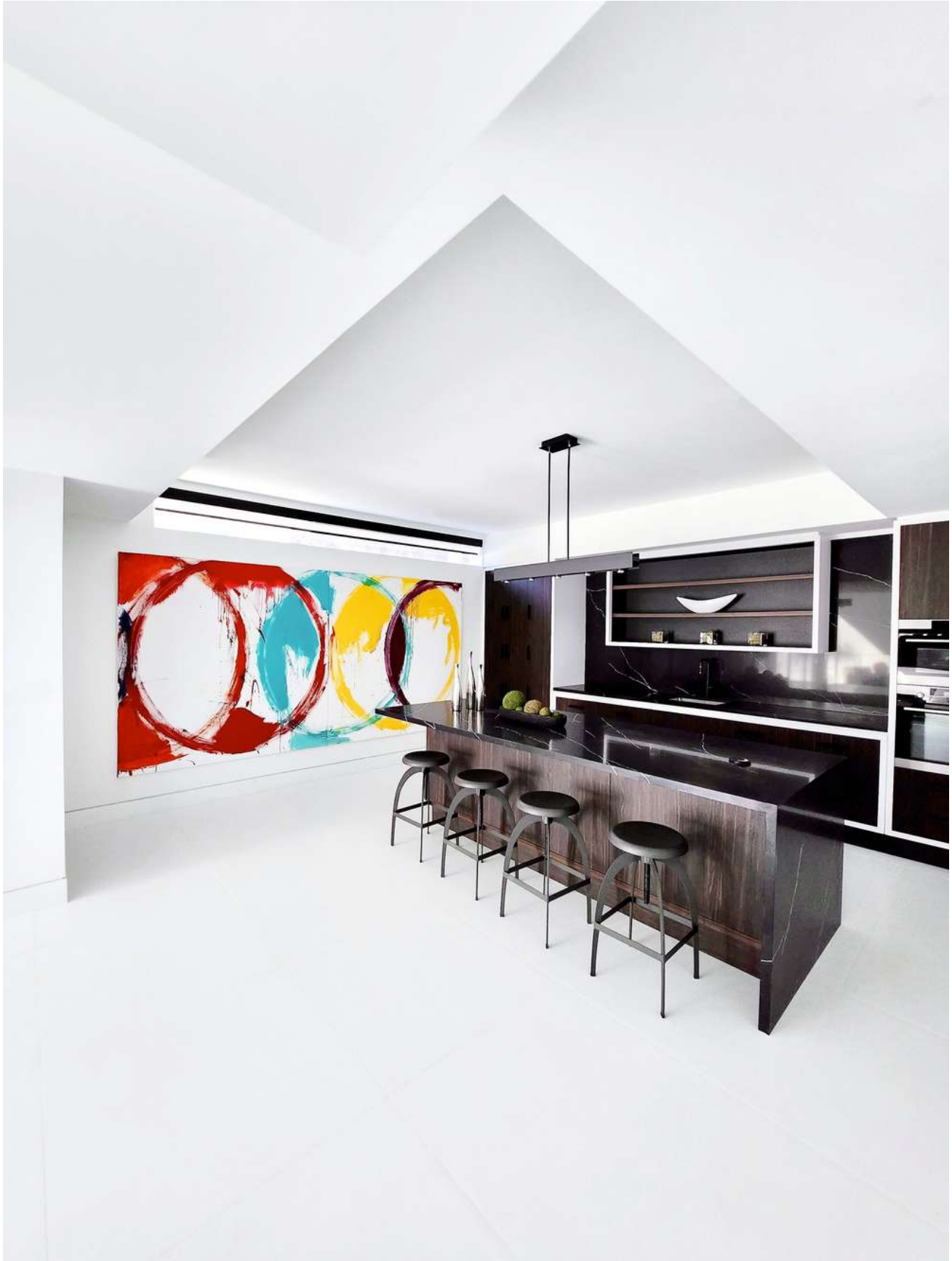
PETER TRIANTOS Circle #3 & #4, 2018 acrylic on canvas 72" x 72" | 183 x 183 cm