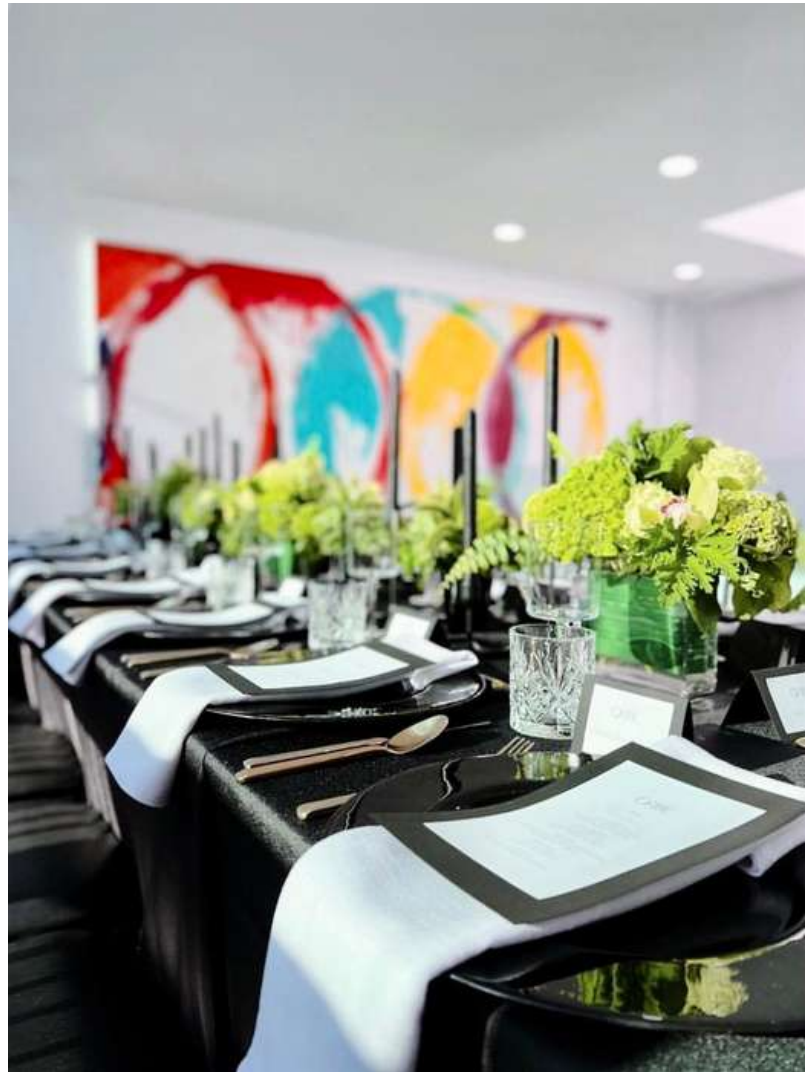
PETER TRIANTOS Circle #3 & #4, 2018 acrylic on canvas 72" x 72" | 183 x 183 cm