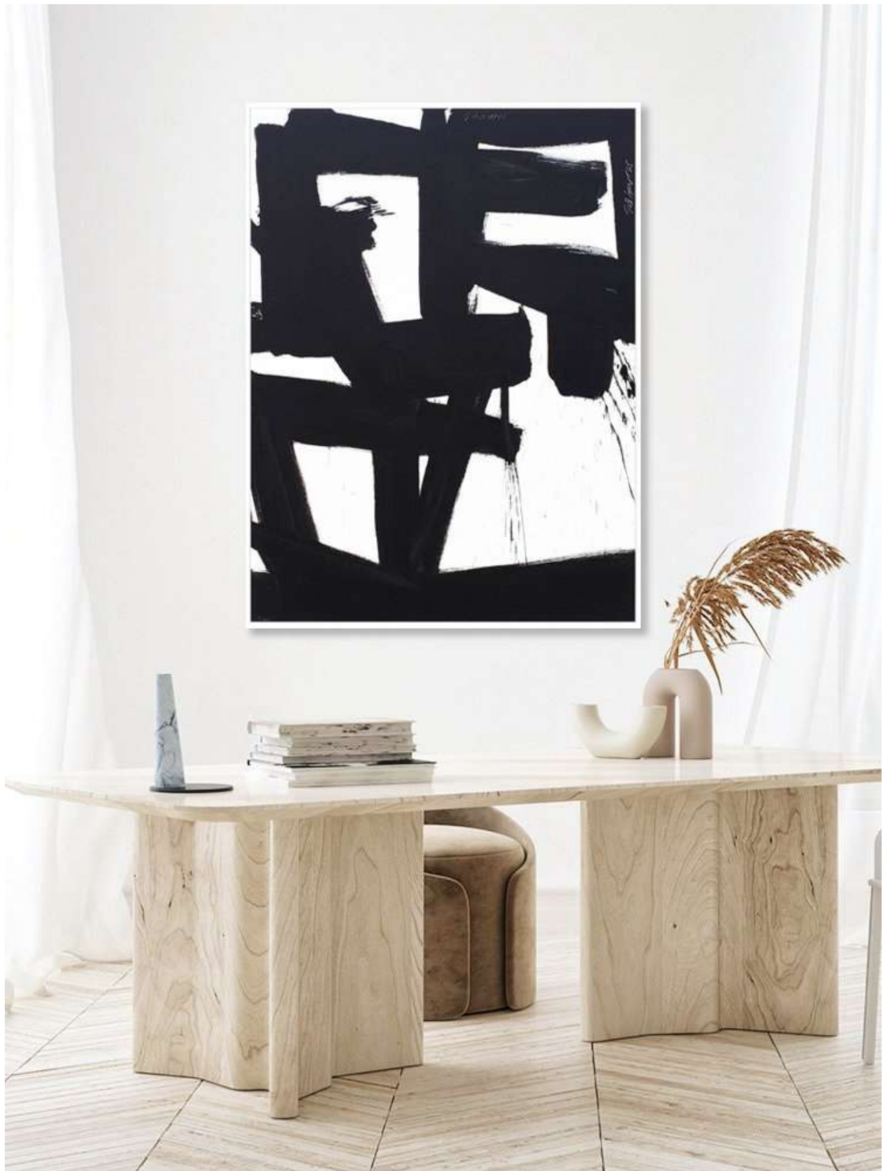
PETER TRIANTOS Black and White #82, 2019 acrylic on canvas 48" x 36" | 122 x 91.4 cm