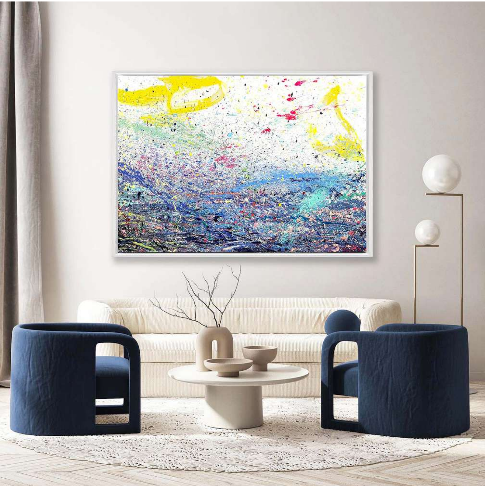
PETER TRIANTOS Napa Valley #139, 2023 acrylic on canvas 60" x 84" | 152.4 x 213 cm