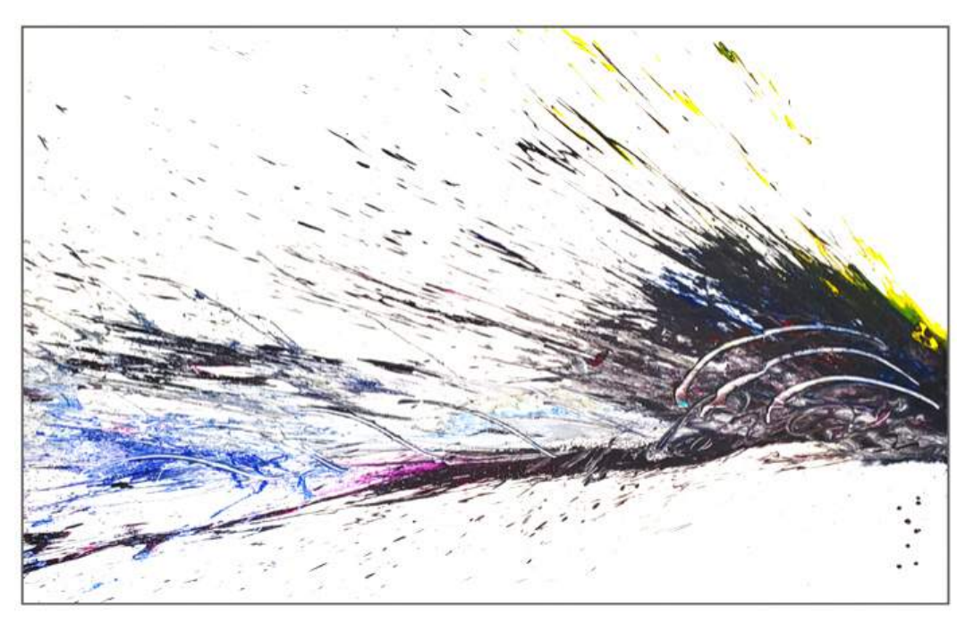
Splash of Colour<sup>2</sup> #167, 2019, acrylic on canvas, 60" x 96"

The artist decided to gift his piece after a breathtaking masterclass he gave to their wonderful students. He taught them how to create an abstract work of art using not only paintbrushes and oils but also energy, inspiration, and love.